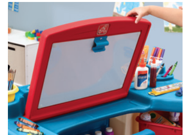
Design and colors may vary