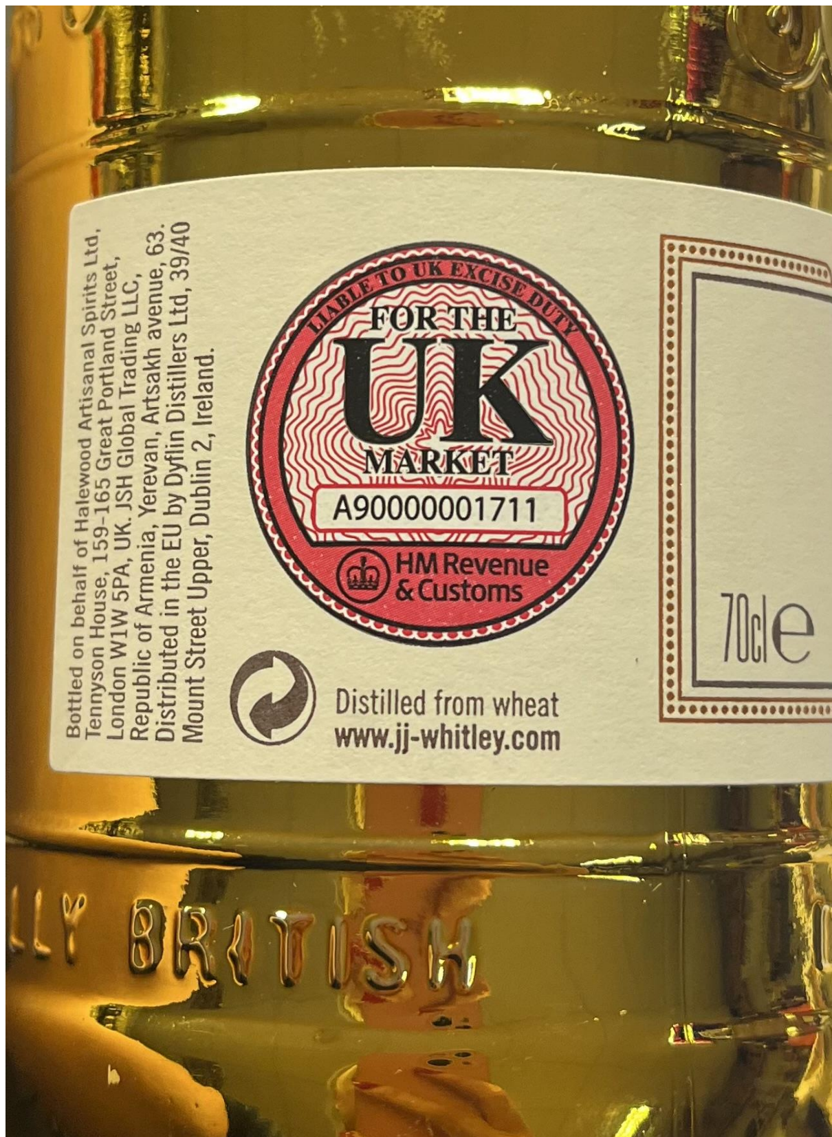
Whitley Neill Vodka, 70cl