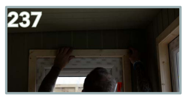
Install the 45mm overlapping framing on top of the beaded panel. Ensure it is flush around all edges and trim if necessary.