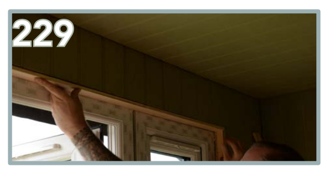
Start to apply the internal framing for the door. This is the same process as the external framing (see Step 184). Start at the top, ensuring the board is flush to the edge.