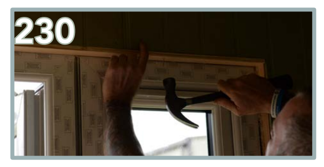
Nail into place using 6 x 30mm nails.