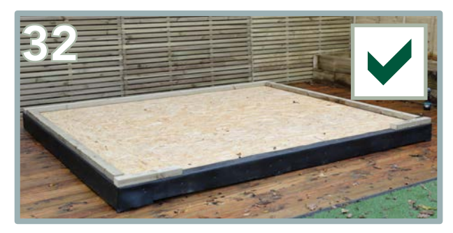
The final result is shown above.