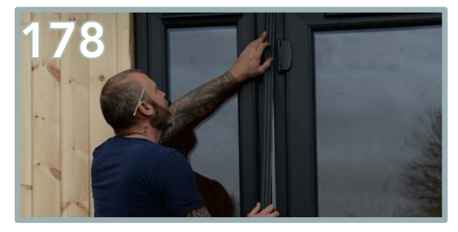
Where the frames adjoin, clip the strip provided into the fixed metal capping. This will clip into the fixed metal capping. To further secure, you can also add glue to the strip.