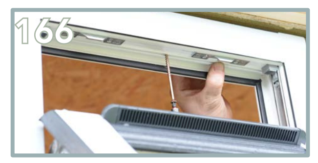
Further secure the window with 1 x 112mm screw into the top and 1 x 112mm into the bottom.