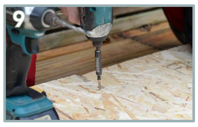
Using 4 x 35mm screws, pre-drill and screw where the adjoining panels intersect. This will secure the floor panels together. Repeat the same process for the third panel (E).