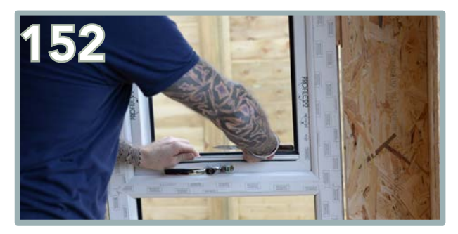
Using a chisel, break off the excess ends of the packers to create a neat finish. Remove the beading around the edge, ready for the glazing to be inserted.