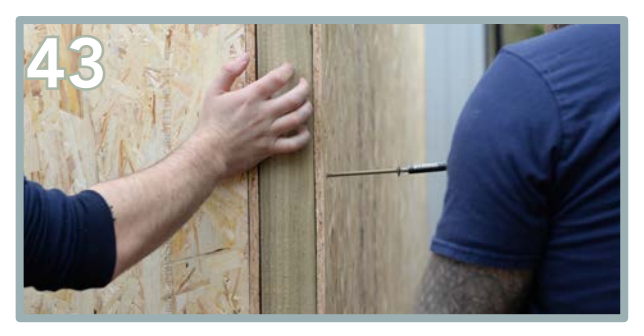
Pre-drill and screw through the Back Panel (L) into Side Panel (M) using 3 x 150mm screws (top, middle and bottom). Continue on each side with Side Panel 2 (K).