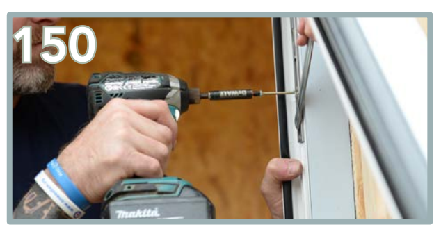
Fix the sides of the frame to the wall panels using the star head 112mm screws at the measurements marked out. Don't forget to fix the top and bottom of the frames as shown in step 166.