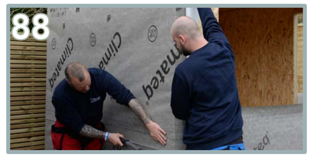
Repeat the same process for the top half of the building. Ensure the starting point is flush to the top of the back wall panels.