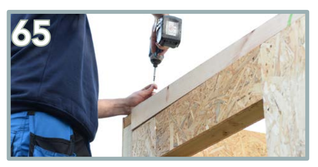
Use 2 x 125mm screws to secure the thicker end of the firring component.