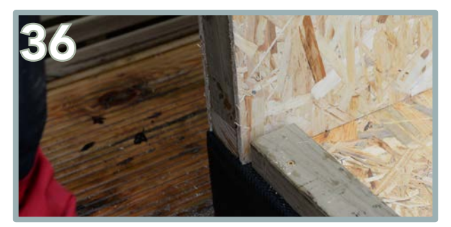
In the left hand corner, the wall panel will be flush to the edge and the floor plate as shown above.