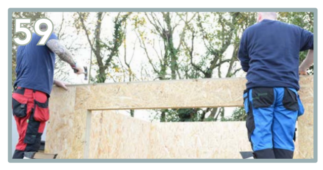
Insert the Front Wall Plate (AP), knocking into place. Expect this to be tight fitting. Ensure it is flush to the top and ends.