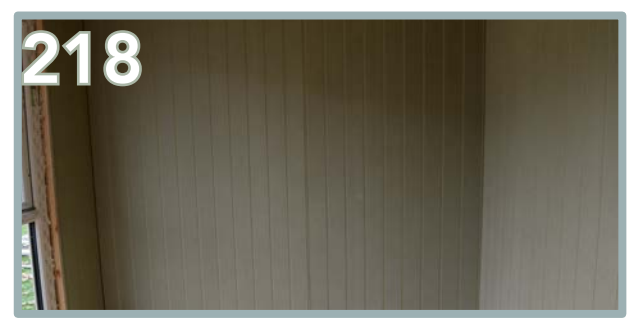
Use 4 x 50mm screws on each side and 2 x 50mm screws into the panel centre into the middle battens for both panels.

On the side panels, work from the front to the back. Ensure the window board is flush to the window edges. Then secure the next side piece. This is already trimmed for the provided space.