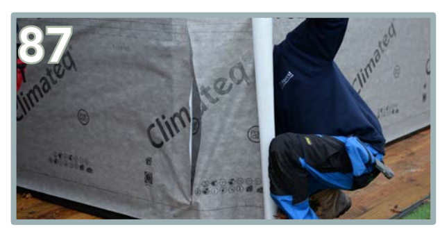
Once the starting point has been overlapped, cut off the excess and staple the end of the material into place.