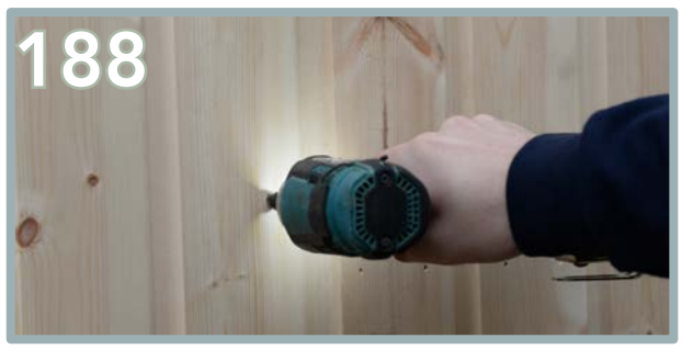
You will need to fill in the holes of each screw in the T&G panels to create a flat finish. Further countersink the screws and enlarge the hole's by 10mm.