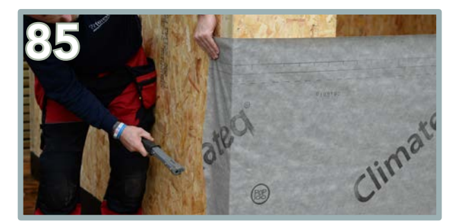
Then wrap the excess around the corner and staple the starting point into place.