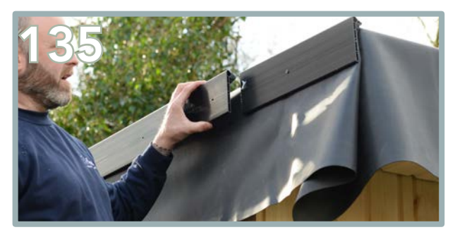
Install the piece cut to size in Step 134. Ensure it is flush to the front edge and butts up against the plastic trim already pinned into place.