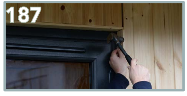
Secure into place with 5 x 30mm nails. Repeat the process for the opposite side of the door frame. Then repeat the same application around the window frame.