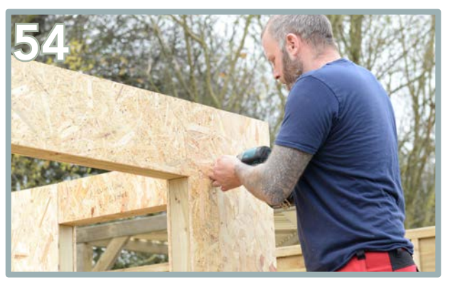
Use 35mm screws to secure the lintel in place by screwing from both outside and inside of each wall panel into the lintel. This will use a total of 8 x 35mm screws.