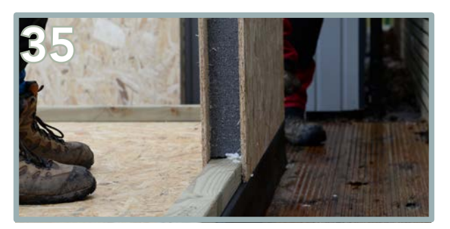
Place onto the floor plate and the wall panel will sit flush to the edge.