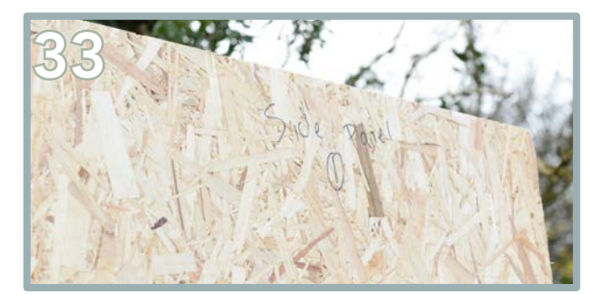
Next, start to build your walls. Each wall panel is labelled according to the layout shown above and the components list at the back of this guide.