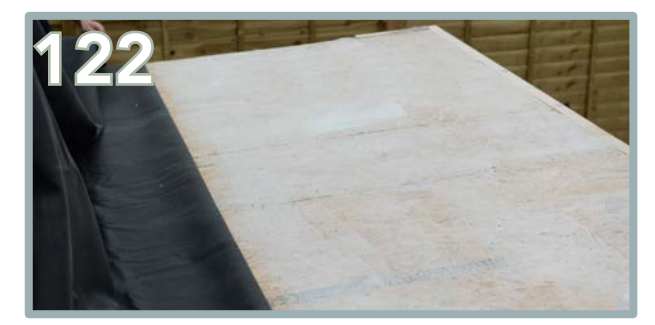
Apply glue to half of the roof, making sure to reach all edges.