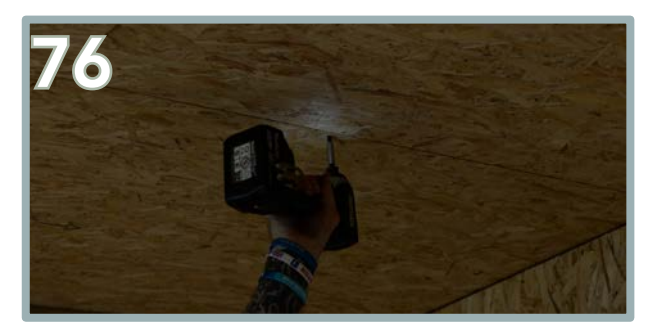
Pre-drill and secure 5 x 35mm screws where the adjoining panels intersect.