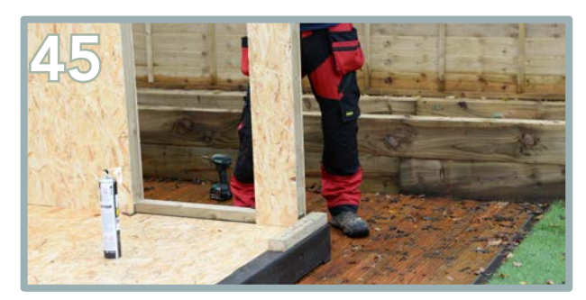
Install the Window Panel (N1) as shown above, leaving the provided space for the window insert. This is labelled on the layout.