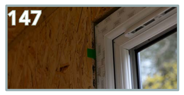
Insert packers around all edges and intervals to level it and maintain the 5mm expansion gap. Ensure the back of the frame is in line with the OSB sheet inner face as shown above.