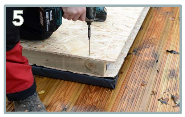
Using 125mm screws, screw through the floor panel into the floor bearer beneath. Repeat the process for the 4 other screws. Ensure each screw is countersunk.