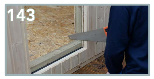
Remove the timber excess from the window section before inserting the window frame. Take out any screws in this section and cut with a saw, using the inner edge as a guide.