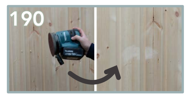
Finish with slightly cutting down and/or just sanding off any excess showing to produce a seamless finish. Repeat this process for every screw hole in the T&G panels.