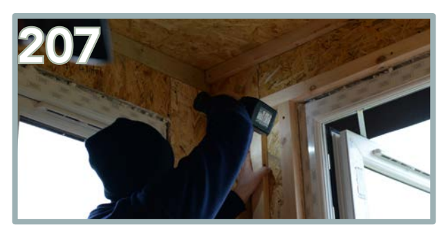
Using 4 x 80mm screws, secure a batten between the two added in Step 206. Repeat on the other side of the door.