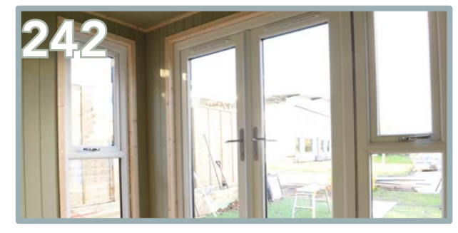
The final result of the windows and door.