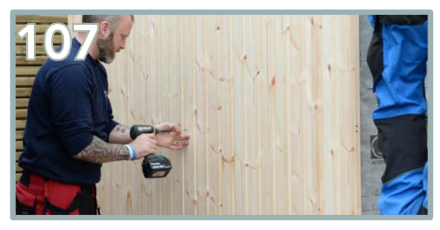
Using 3 x 80mm screws, screw the rearmost side of the T&G Panel (BA) into place into place.