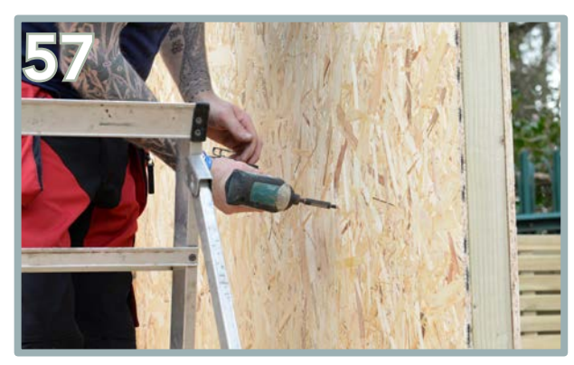
Where spline panels have been used to join side panels, use 5 x 35mm screws to secure from top to bottom along the connection. Do not screw directly into the adjoining line. Repeat this process for every adjoining panel.