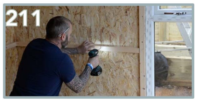
Secure the three shorter 45x28mm battens between the window and back wall at the same height as the back wall battens. These will be flush end to end.