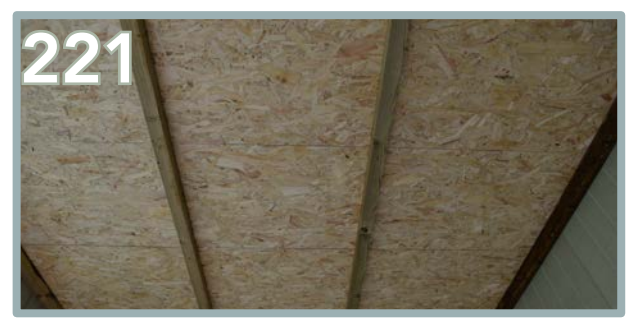
Measure and mark out equal spacing for the rest of the central battens. Position and secure with 5 x 80mm screws per roof batten.

Install the 45x45mm roof battens. Start at the front. Ensure the first batten is flush end to end and against the front beaded panels. Secure with 5 x 80mm screws. Repeat the process to install a roof batten against the back wall.