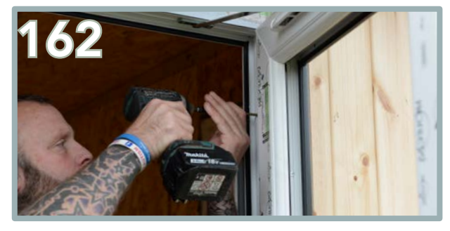
These should be drilled 150mm from the top and bottom corners and 300mm from the 150mm points with the 112mm screws.