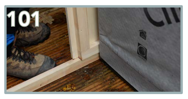
Repeat the same process for the second Back Panel (BI). Use a rubber mallet to softly knock the second back panel into the first, so the T&G Panels interlock. Repeat the same process for the (AX) T&G Panel.