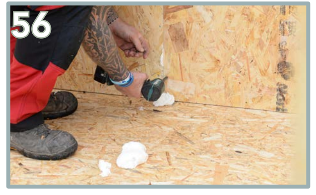
Repeat the process from the inside, using 3 x 35mm screws per panel once again.