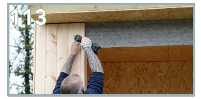
Repeat the process for the other Front T&G Panel (BE).