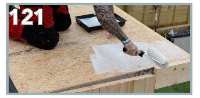
Pour the glue into a paint tray and use a roller for easier application.