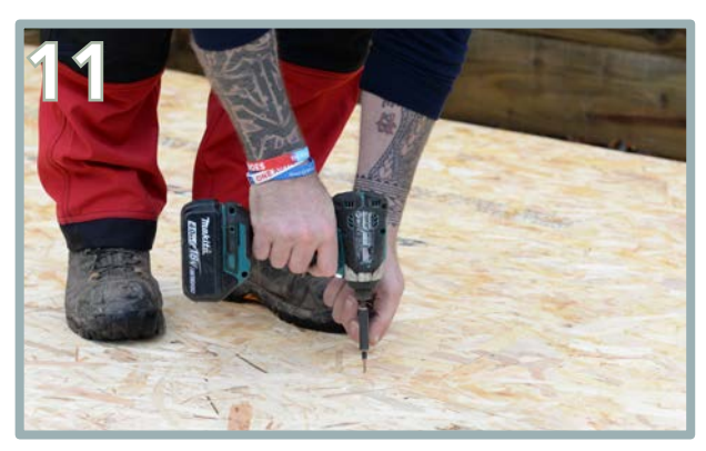
Once happy that all panels are in the correct position, further secure with 5 x 125mm screws along the outer edge of the fourth panel.