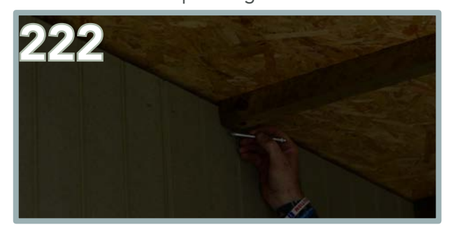
Mark out a guide line underneath all the battens at both ends. This will ensure that you drill into the battens when securing the roof panels.

As the roof has smaller MDF roof panels at the front, measure out and ensure that the smaller MDF roof panel at the front roof MDF panels will fit half way onto the second batten(shown in step 219) from front to back. If unsure, use the below steps as a guide.