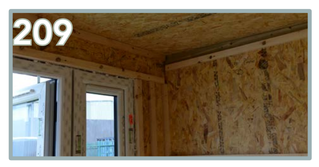
Use 5 x 80mm screws for each batten. The battens on the left hand side will not be aligned to the front batten positions.