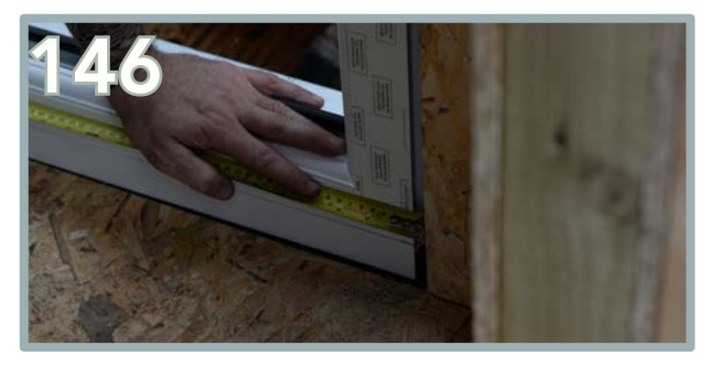
Apply adhesive silicone to the base and carefully position the new frame into the aperture. Ensure to centralise it.