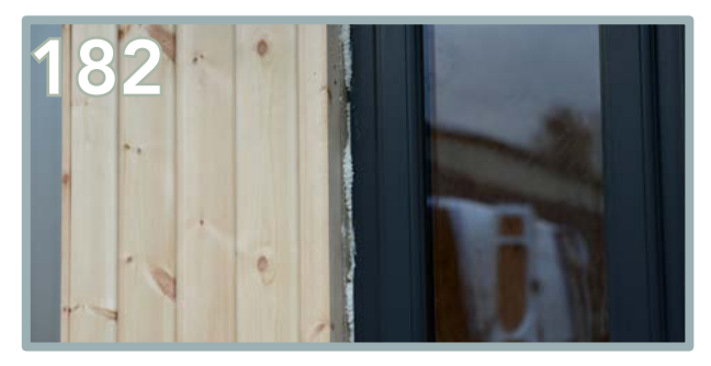
The expanding foam will be tack free in about 20 minutes. It can be cut back after 12 hours and will be fully cured in 12-24 hours.

Need some extra help with the window and door sections? Access our 'how to' video at forestgarden.co.uk