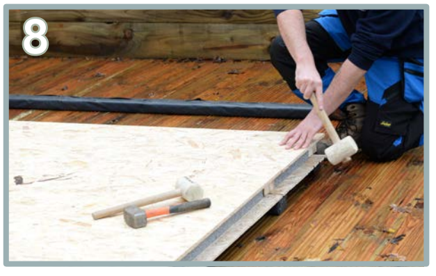
Knock on the front and back of the second panel to ensure it is flush on both edges to the first panel and floor bearers.