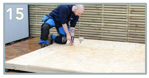
Using 35mm screws, screw 3 across the top and 5 down the sides of each OSB sheet. Screw along the sides first.