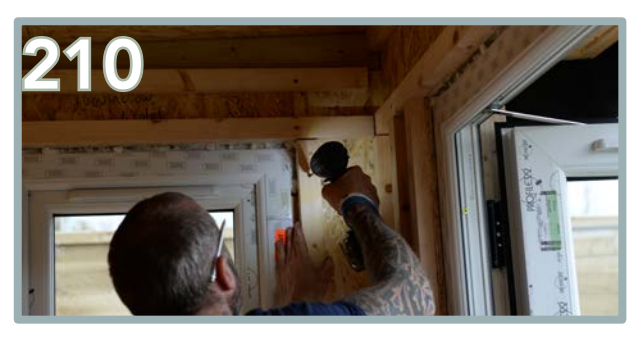
On the right-hand wall, secure a batten at the top of the wall, in line with the top back wall batten, using 5 x 80mm screws. Secure a second batten along the wall so it is flush with the top of the window frame. Finish framing the window by securing a 45x25x1960mm batten on either side of the window using 4 x 80mm screws for each batten.