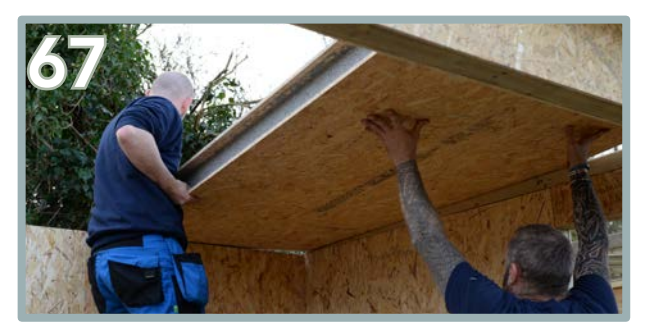
Lift up the first Roof Panel (X). Ensure at least 3 adults help carefully lift up the roof panels as they are heavy.