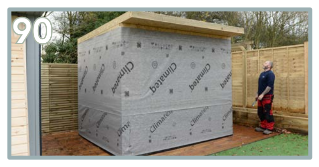
There will be a slight gap at the front and on the sides due to the angle of the roof.