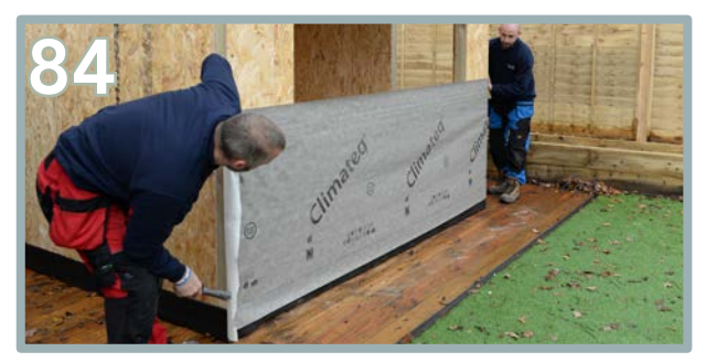
Starting with the bottom section, pull the membrane tightly and staple into place.