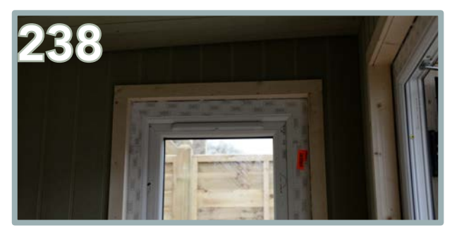
Use 5 \times 30 mm nails per side 45mm board. Finish with the top board using 4 \times 30 mm nails to secure.