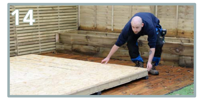
Position OSB floor sheets (AE) on top of the floor panels one at a time. Ensure they are flush to all edges and screw into the corners to keep secure.