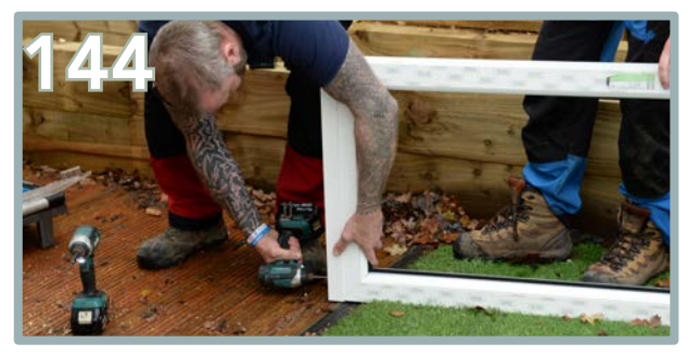
Remove any packaging from the new frame and screw the sill into the bottom of the frame. Use 2 x 50mm screws and ensure not to penetrate the inner skin of the frame.