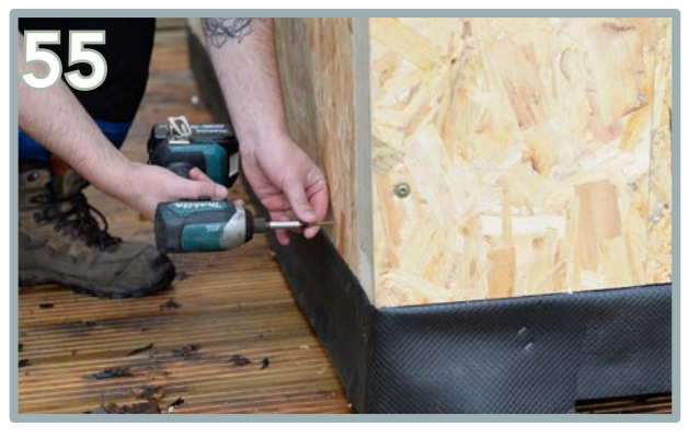
Once all of the wall panels are up, begin to secure each wall panel to the floor plate underneath. Use 3 x 35mm screws per panel externally.