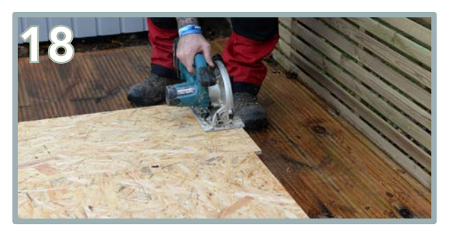
Some pieces may be oversized. If this is the case, saw off any excess once the sheets are screwed in place to create a flush finish.