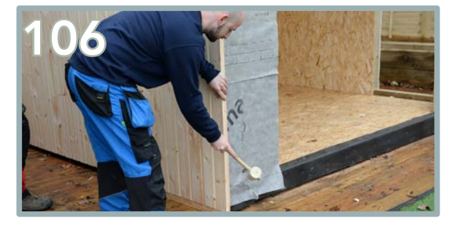
Use a rubber mallet to softly knock the second Side Panel (BH) into the first, so the T&G panels interlock. Repeat the same process for the T&G Panel (BA).