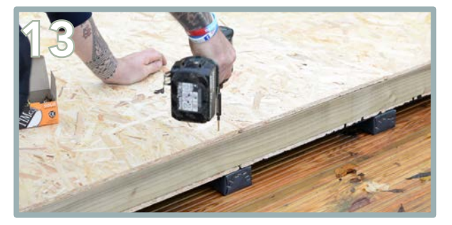
Pre-drill and use 4 x 125mm screws ensuring each screw goes into the bearer beneath. Screw 35mm screws between the 125mm screws. Repeat process for the other floor capping.