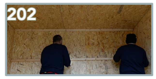
Use 5 x 80mm screws to secure equally across the third batten in place.