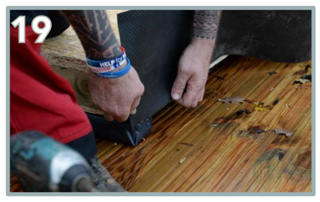
Start to unwrap the DPC roll and choose a starting point on the base's outer face. Ensure it covers half of the bearers and staple into place.