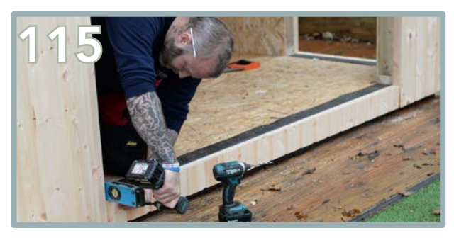
Repeat the same process as the lintel for the Kick Plate T&G Panel (BF) that goes underneath the door opening.