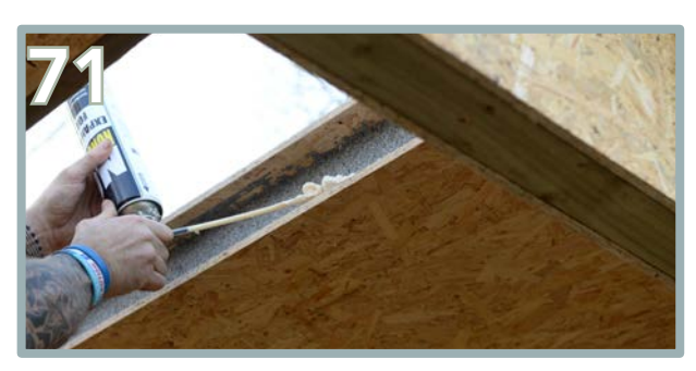
Use expanding foam in the groove of the roof panel and knock into place. Ensure the roof is flush to the front and back of the first roof panel.