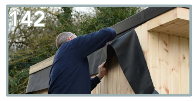
Once the plastic trims are complete around the roof, using a Stanley knife remove all of the EPDM excess. Use the plastic trims as a guide. Be careful not to cut the T&G panels behind.