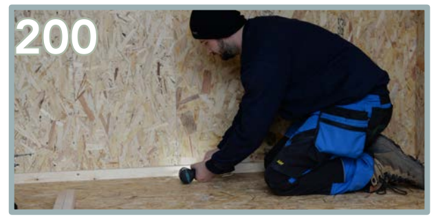
Repeat the process at the bottom of the wall, ensuring the second batten is flush with the floor and end to end. Use 5 x 80mm screws along the batten at equal spaces.