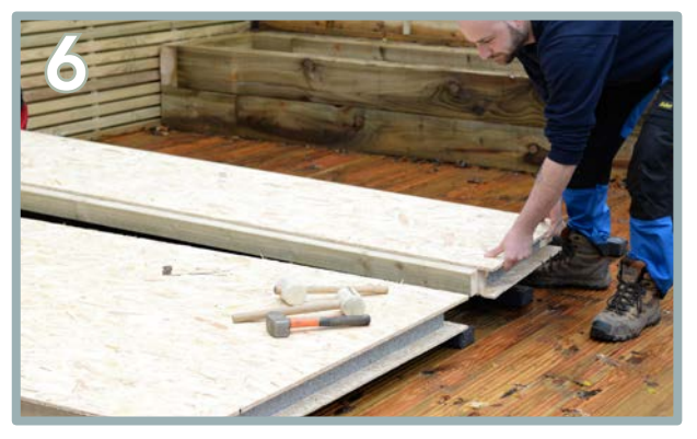
Place the second floor panel (E) onto the middle bearers. Ensure the panel is positioned half way on both bearers.