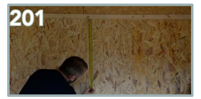
Measure and mark out even spaces to position the two middle battens.