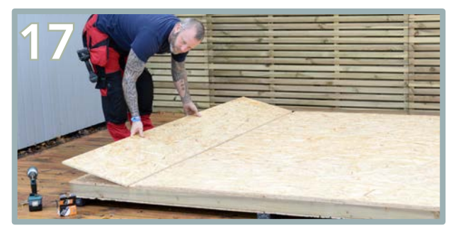
Position the final OSB sheet (AD).