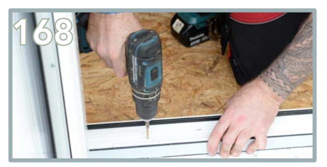
Drill 150mm from the both internal sides of the double doors. Use 112mm screws to screw into place at each side into the bottom of the frame as shown above.