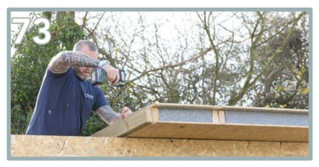
Secure the second roof panel to the front and back panels. Use 2 x 150mm screws at the back and 2 x 150mm screws at the front. Repeat steps 71-73 for the third Roof Panel (Y).