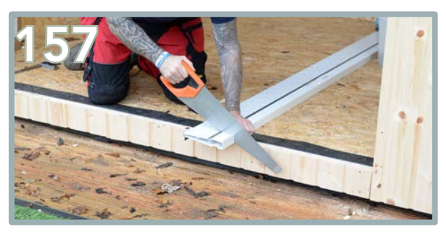
The door ledge will be oversized by 100mm. You will need to measure and cut off the excess.