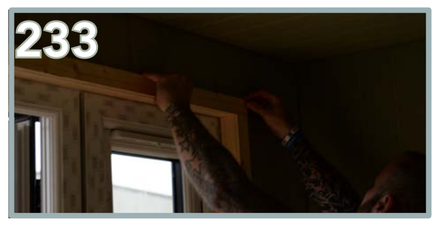
The top frame will sit on top of the side boards. Ensure both ends are flush to the side framing edge. Trim if necessary.