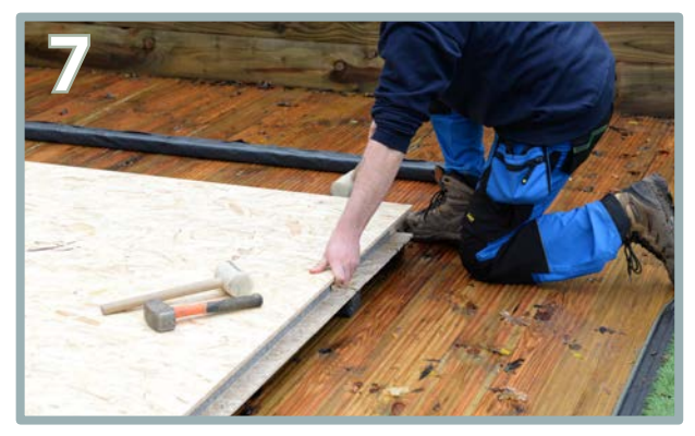
Using a rubber mallet, knock the second panel into the first for a tight fit.