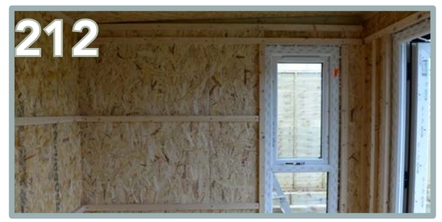
Use 4 x 80mm screws for each of the three smaller battens.