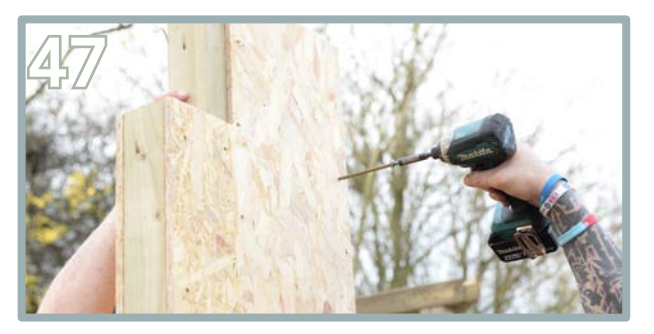
Position the screw roughly 45mm from the outer edge. Pre-drill and screw through the front into the side wall panel using 3 x 150mm screws (top, middle and bottom).