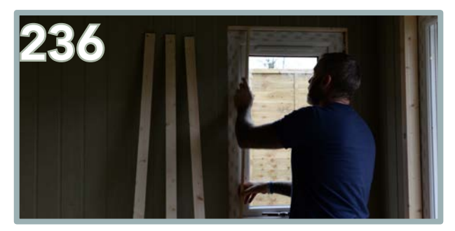
Apply the side framing, using 5 x 30mm nails per board.