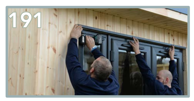
Position the top plastic 'L' strip across the door. Pre-drill the face underneath and fix first.