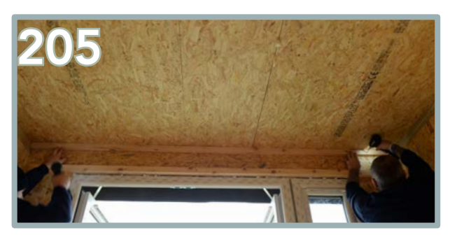
Secure one batten above the door opening, flush to the edge opening. Secure the top batten flush to the ceiling. Use 5 x 80mm screws per batten.