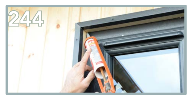
Start at the top and trail down to the ledge at the bottom. Keep the amount of silicone consistent as you trail down.