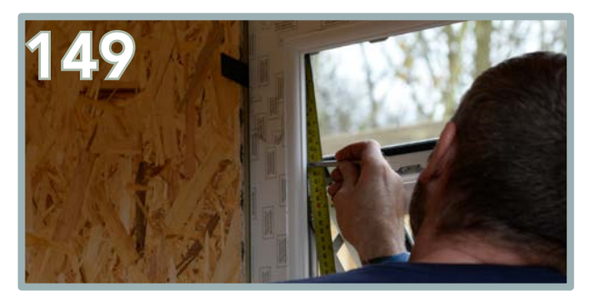
These should be drilled 150mm from the top and bottom corners and 300mm from the 150mm point at both sides. Use packers at the fixing points to avoid distortion to the frame.