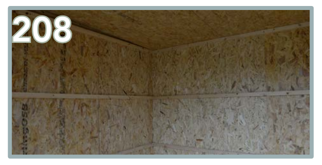
Secure four 45 x 28mm battens onto the left hand wall in line with and at the same height as the four back wall battens. These should be flush end to end.