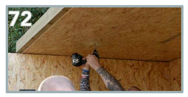
Pre-drill and screw 5 x 35mm screws, where the adjoining panels intersect. This will secure the roof panels together. Then secure the first roof panel's corners with 2 x 150mm screws.