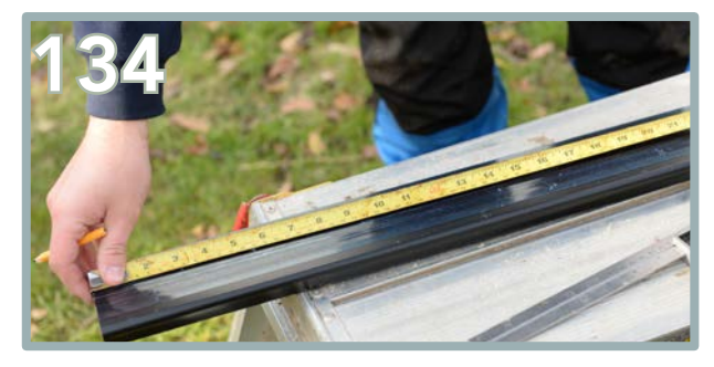
The other plastic trims will need to be measured and cut using a hand saw to fit next to the fixed roof trim. Further detail will be shown throughout the application of the trims below.