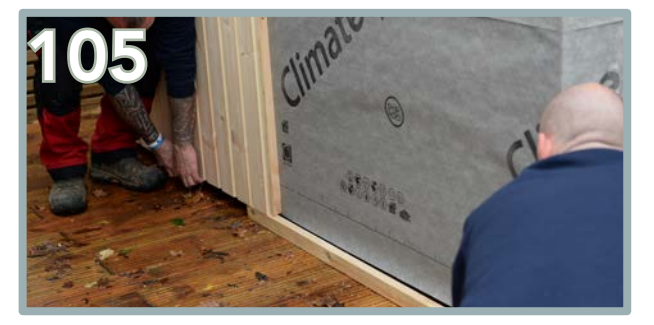
Ensure the cladded panels are 45mm off the ground. If you are using the batten as a guide, slightly lift up the secured panel to ensure it is carefully removed to prevent any damage.