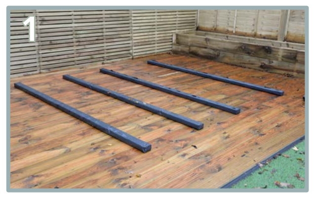
Lay the bearers down and spread them out roughly ready to position the floor panels on top.