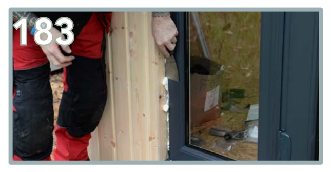
Remove all excess expanding foam around the window and door frames. Preferably, wait for the expanding foam to cure for easier removal.