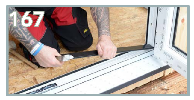
Remove the plastic strips from the bottom of the door frame. Keep hold of these pieces to reapply afterwards.