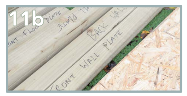
The components provided will be labelled according to the components list at the back of this guide book.