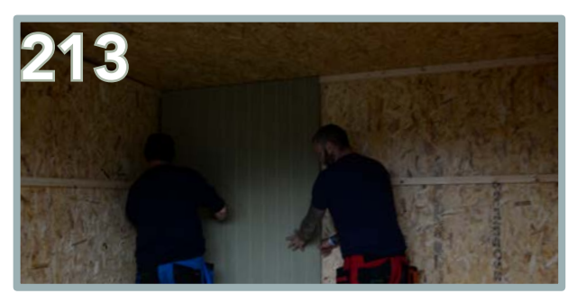
To install the beaded wall panels, start at the back left-hand corner. Ensure the rounded edge of the panel is against the left-hand side. Use 4 x 50mm screws on each side and 2 x 50mm screws into the panel centre into the middle battens.