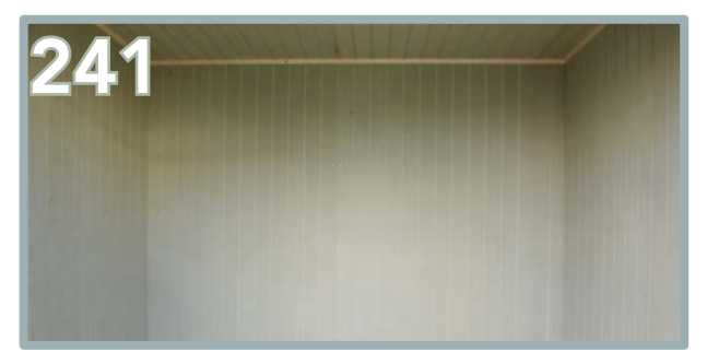
Use 5 x 30mm nails for the roof trims on each side. The final result at the back.