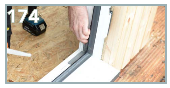
The glass should be packed using the toe and heel process. Toe and heeling works by supporting the double glazed unit with the packers.