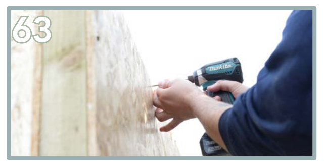
Further secure each of the wall plates with 3 x 35mm screws externally and 3 x 35mm internally, through the side panels into the plate, between the 125mm screws.