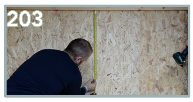
Repeat the same process to measure and mark out the position for the fourth back batten.