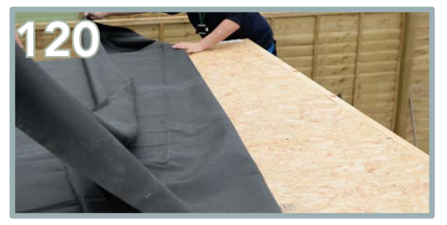
Fold the EPDM back to half way across the roof - we recommend two people for this. Be careful when moving on and around the roof to prevent any possible injuries.