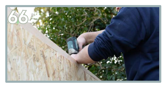
Use 2 x 35mm screws to secure the thinner end of the firring component. Repeat this process for the other firring.