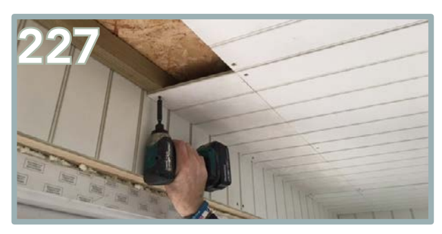
Apply the smaller MDF roof panels at the front. Work from left to right and ensure they line up with the secured roof panels. Secure with 6 x 50mm screws per panel.

Repeat the same process. Ensure the rounded edge is butted up against the chamfered edge on the first panel. Use 4 \times 50 mm screws on each side and 2 \times 50 mm screws in the centre of the panel.