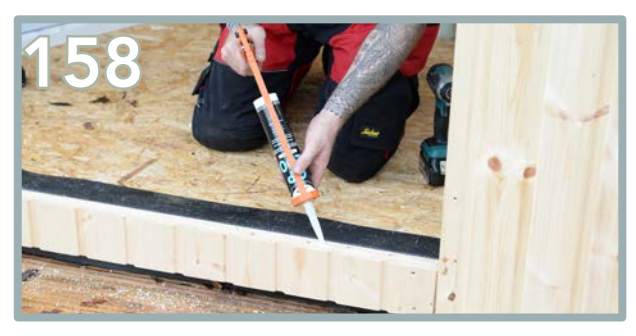
Apply the adhesive silicone in the door section. Be sure to seal the ends of sill and frame assembly to prevent moisture from tracking along the sill and into the wood work.