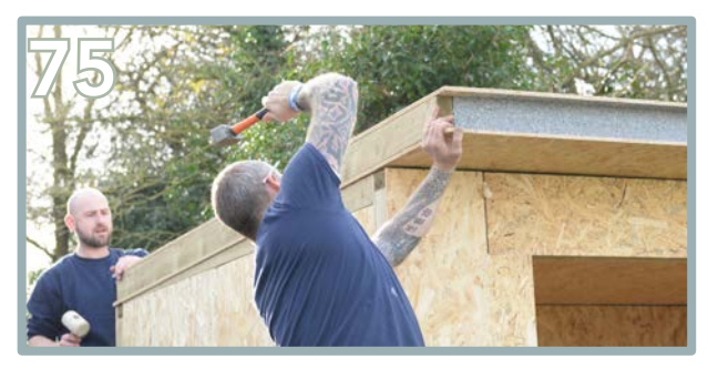
Knock further into place to allow the roof panel to be as flush as possible to the wall face.