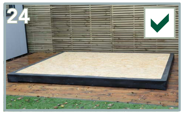
The final result is shown above.