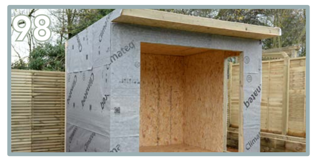
The final result is shown above. You do not need to add membrane to the canopy / the roof overhang.