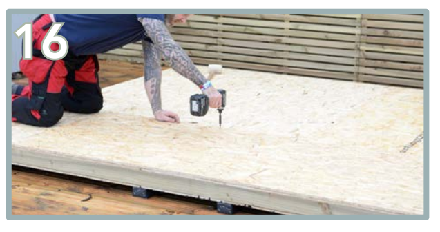
Screw the central screws into place, resulting in 3 in a row. This will result in 15 x 35mm screws per OSB sheet.