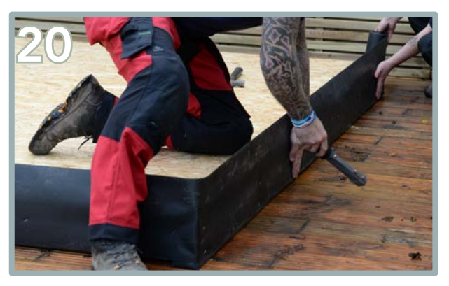
Continue to wrap around the base. We suggest one person unwraps while the other follows behind stapling the DPC into place.