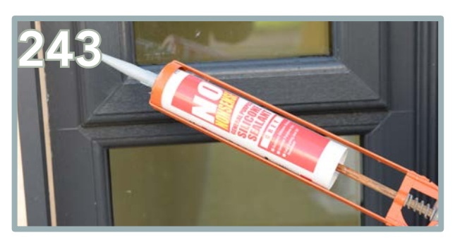
You will be provided a silicone seal for the windows and doors. The colour provided will match your windows and doors.