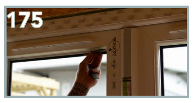
Apply silicone and stick the packers at diagonal opposing corners. Place the pane into position, ensuring it is centralised and packed correctly, holding the pane square.