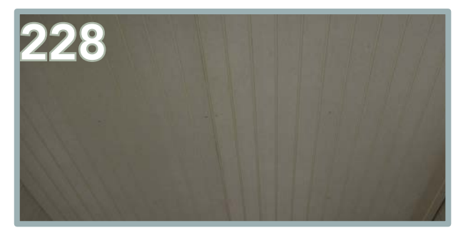
The final result is shown above.