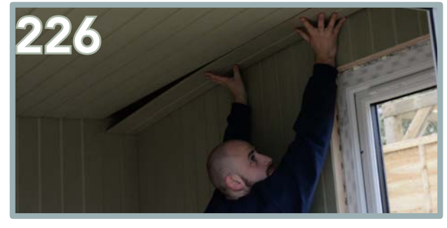
Apply the other roof panels using the same process. Use 10 x 50mm screws to secure.