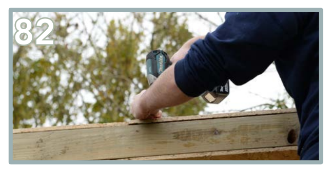
Use 4 x 80mm screws into the front roof panel cap. Use 3 x 35mm screws between the 80mm screws to fully secure.