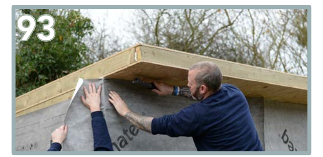
Using the excess membrane, cover the front flush up to the roof.