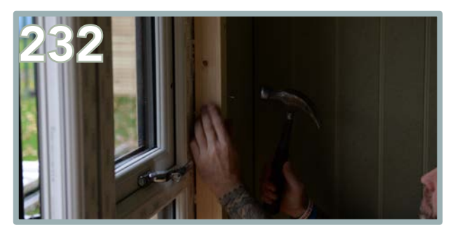
Install the 45mm overlapping framing on top of the beaded panel. Ensure this is flush to the inner framing. Use 5 x 30mm nails to secure. Repeat this process on the opposite side.