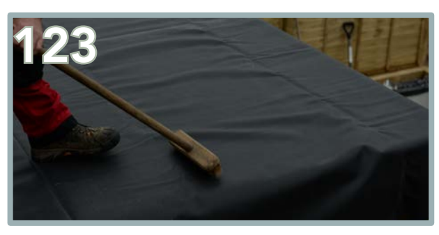
Roll the EPDM back on to the glue. Use a brush/ broom to create an even, flat finish. You need to act quickly once the glue has been applied.