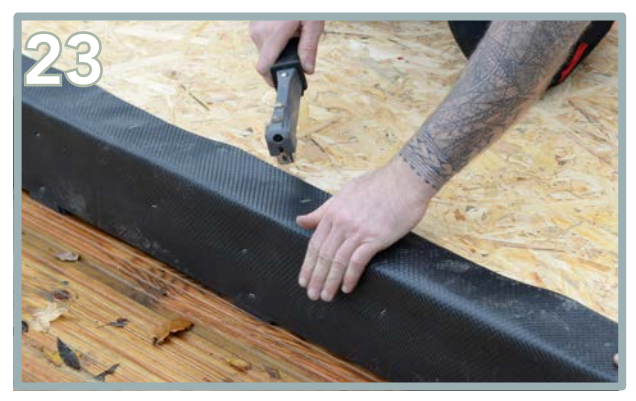
Continue folding the overhang and corners of DPC onto the OSB sheets as you make your way around and staple into place.