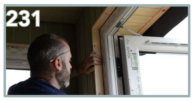
Install the internal sides on either side of the door. Trim to fit if necessary. Use 5 x 60mm nails for each board to secure.