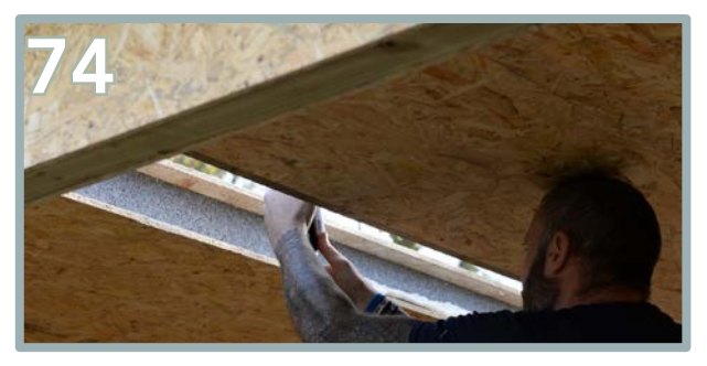
Lift up the final Roof panel (Z) and apply expanding foam into the inner groove as shown above.