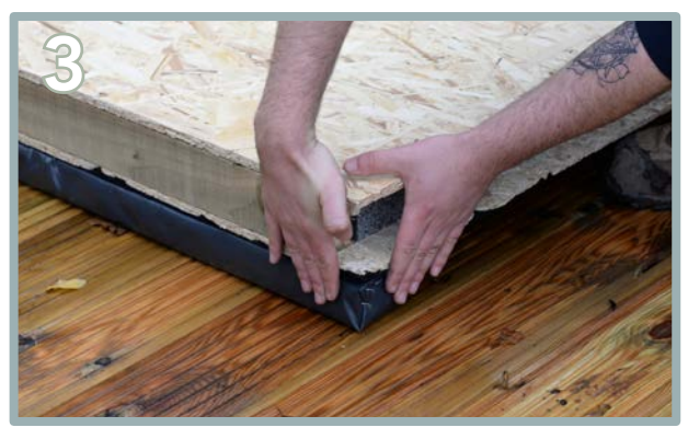
Ensure the panel is flush to the edges of the first bearer. Ensure the floor panel on the bearers are level using a spirit level as a guide.