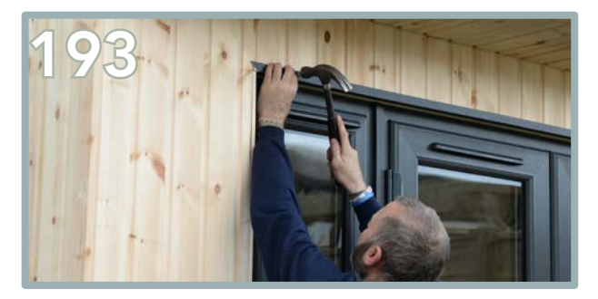
Pre-drill across the top and repeat the same process. Use 5 pins across the front of the plastic trim.