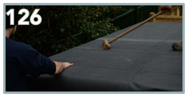
Finish with a final brush on the EPDM to produce a flat and even result.