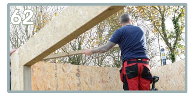
Insert the Side Wall Plate (AN). Pre-drill and secure with 4 x 125mm screws. Repeat the process for the other side wall plate and the back wall plate.