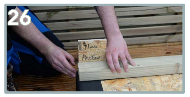
Starting with the back Floor Plate (AP), ensure it is flush at each end and use the 11mm offcut to ensure an 11mm space from the base's back edge all the way along. Pre-drill and screw 4 x 125mm screws along the timber.