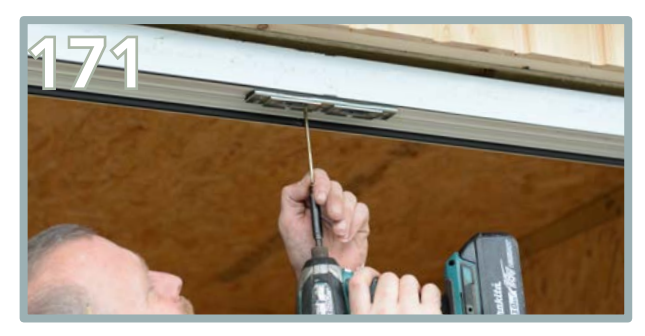
Repeat the same process centrally. Screw 1 x 112mm screw in the centre.