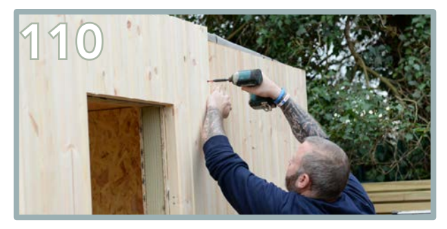
Install the Window Opening Panel (BC) ensuring it is flush to all edges. If not aligned properly, this will cause issues during the window installation.