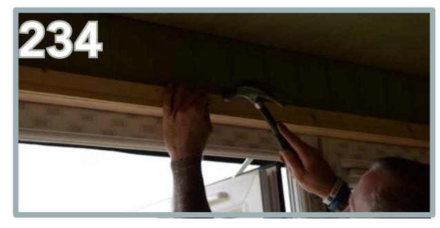
Fix into place using 6 x 30mm nails.