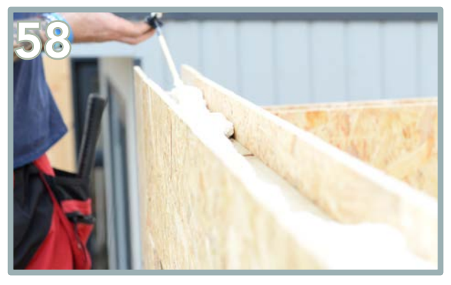
Starting with the front panels, apply expanding foam in the top groove, ready to add the wall plates.