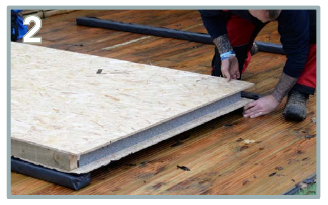
Place the first floor panel (D) on flush to the edge of the first bearer and halfway onto the second bearer. Place the black underside of the floor panel on top of the bearers as shown above.