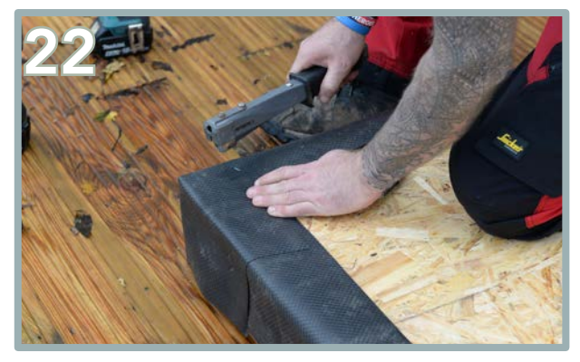
Using a Stanley knife, cut the DPC at the corner to create 2 pieces to easily fold onto the OSB sheets and staple into place.