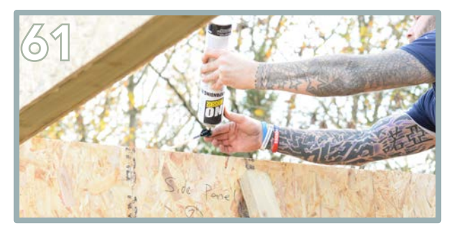
Apply expanding foam to the groove of one of the side panels.