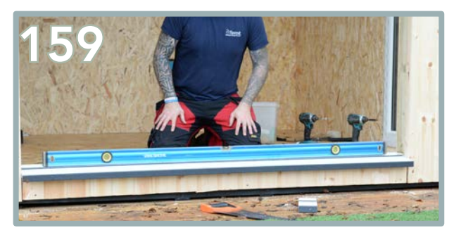
Place the ledge onto the silicone. Ensure it is level and the back edge meets the first edge of the back OSB sheet (the same positioning as the window).