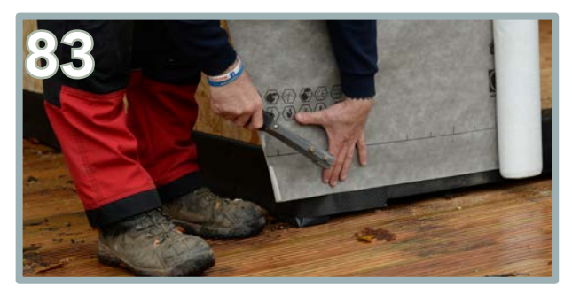
Begin to unwrap the breathable membrane. Position the membrane 45mm from the ground.