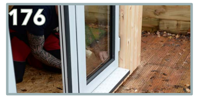
As the pane is positioned, the beading can be installed using a small rubber mallet and tapped securely back into place.

Repeat the same process for the internal strip.