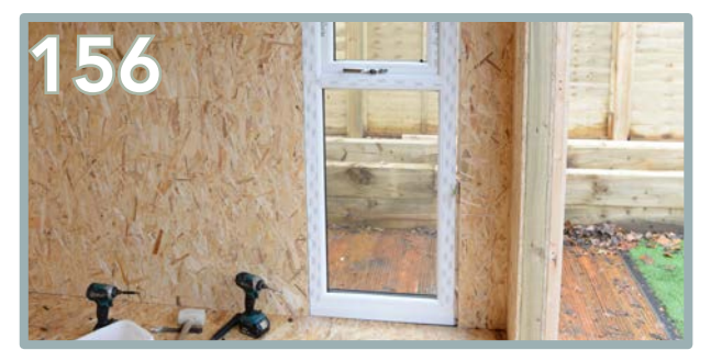
Repeat the same process for the bottom pane, ensuring it is centralised and packed properly using the toe and heel process.