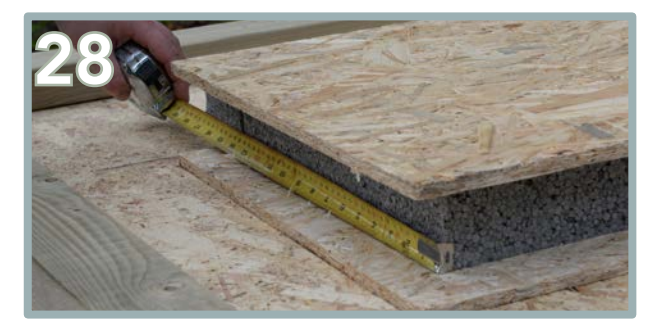
Pre-drill and use 4 x 125mm screws for the front Floor Plate (AP). Apply 2 x 125mm screws per end. Measure the width of your Front Panel (P) from side to side on the OSB sheet.