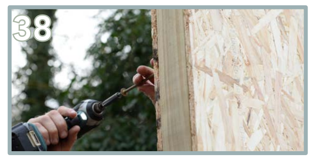
Pre-drill and, using the star drill bit provided in your fixing box, screw through the back into the side wall panel using 3 x 150mm screws (top, middle and bottom).