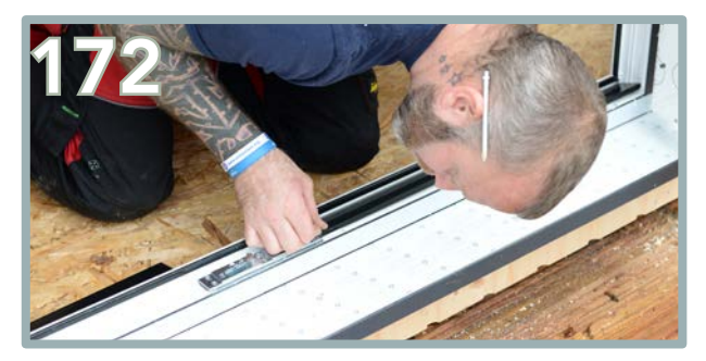
Clip the plastic strips back into the door frame to hide the screws.