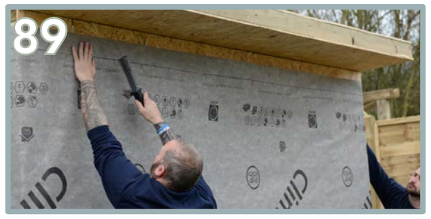
Add additional staples to keep the membrane in place. Be careful not to staple into the door and window gaps.