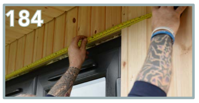
If any of the 50 x 12mm door and window boards are slightly oversized, you will need to measure out your required length. Start with the top board.