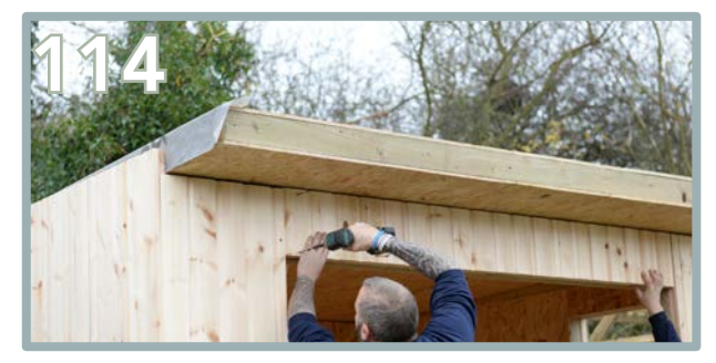
Install the Lintel T&G Panel (BG). This will fit between the front panels. Use 6 x 80mm screws. Make sure to drill through the battens beneath.