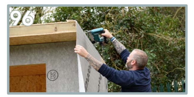
Fold onto the roof, stapling into place.