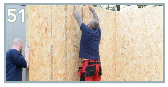
Slide and knock into place.