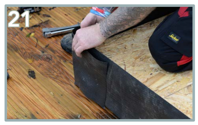
Once fully wrapped around the base, overlap the starting point and staple into place.