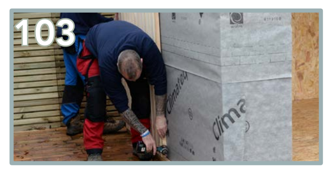
Continue onto the side panels (BB). Knock the first panel in place and ensure it is butted up against the back panel overhang.