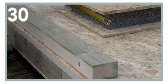
Cut and remove the central part of the front floor plate. This will remove the excess timber from your door opening. Your front panel will sit flush end to end of the front floor plate.