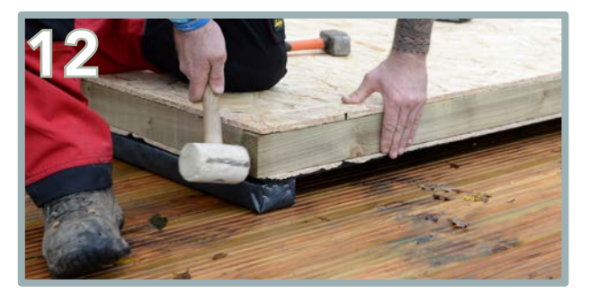
Insert and knock the floor capping (AN) into place using a rubber mallet. Ensure it is flush to all edges.