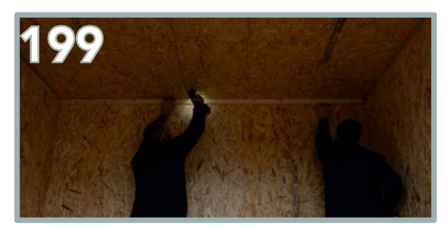
Begin at the back and position the first 45 x 28mm batten flush to the top. This will be the correct length to fit in the space end to end. Use 5 x 80mm screws along the batten.