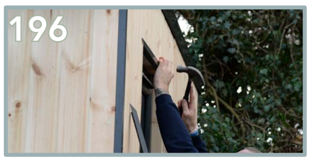
The same process applies for the window frame. Pre-drill and use 2 x pins on the front edge and 3 x pins underneath.