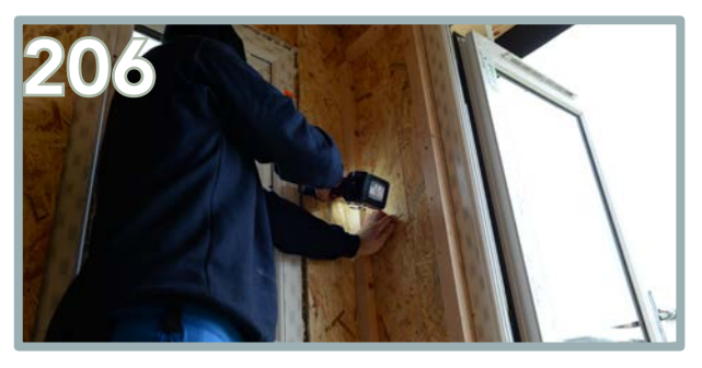
Secure a 45x28x1960mm batten to each side of the door opening with 4 x 80mm screws. Then secure 2 more battens, 1 in each of the front corners, using 4 x 80mm screws per batten.