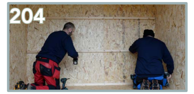
Using 5 \times 80 mm screws to secure into place.