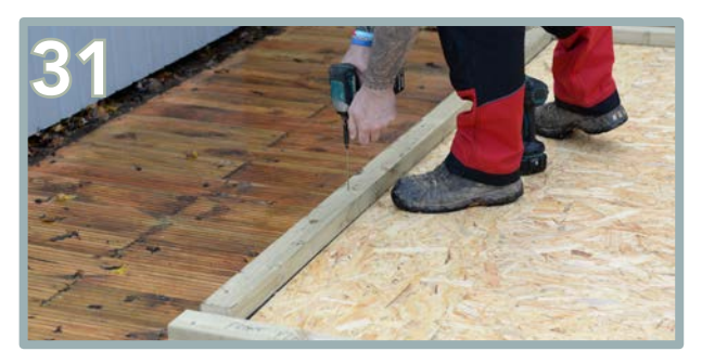
Your side Floor Plates (AN) will fit between your front and back plates. Ensure 11mm from the outer edge and 11mm at each end. Once happy with the position, pre-drill and screw into place using 4 x 125mm screws.