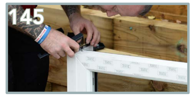
Be sure to seal the ends of sill with the caps provided to prevent moisture from tracking along into the woodwork.