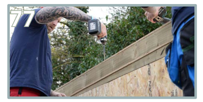
Repeat the same process as the first roof panel using 4 x 150mm screws along the edge to fully secure the roof. Then secure the fourth roof panel's other side edge with 2 x 150mm screws at each corner.