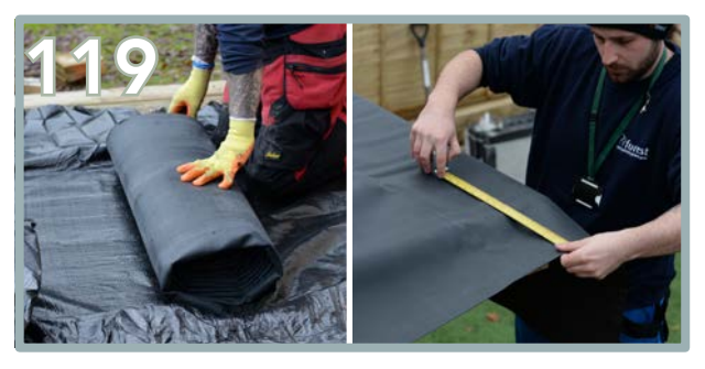
Unwrap the EPDM out onto the floor first. Then measure out on the roof to ensure an equal overhang around all edges.