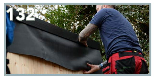
Slot the plastic trim on the top edge, flush to the back.