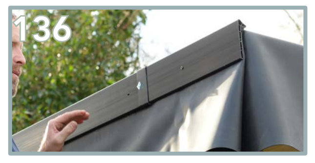
Use the clips provided to secure where the pieces join. Repeat the same process on the opposite side.