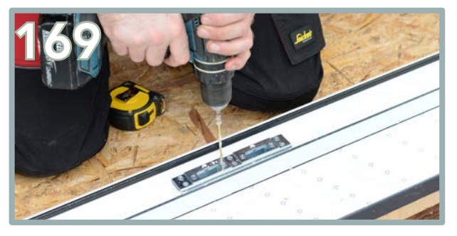
Then screw 1 x 112mm screw into the centre.