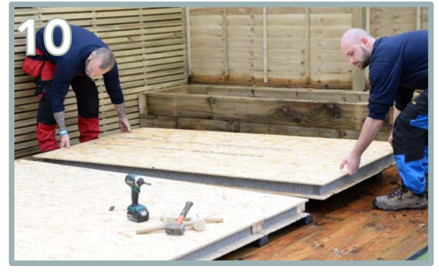
Place the fourth floor panel (F), knock into the third panel and ensure it sits flush on the final floor bearer. Repeat the process using 35mm screws between the third and fourth panels.