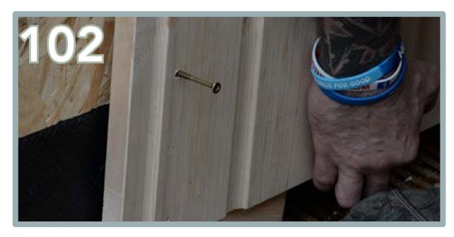
Use 6 x 80mm screws to secure each cladded panel (3 screws down each side). Screw through the batten on the panel and into the wall behind. Leave the screws slightly out in case of adjustment.

At each side, there will be a slight overhang of the T&G board. The batten's edge underneath, attached to the panel should be flush to the end. Use the 45 x 28mm batten as a guide to prvide a 45mm space from the ground.